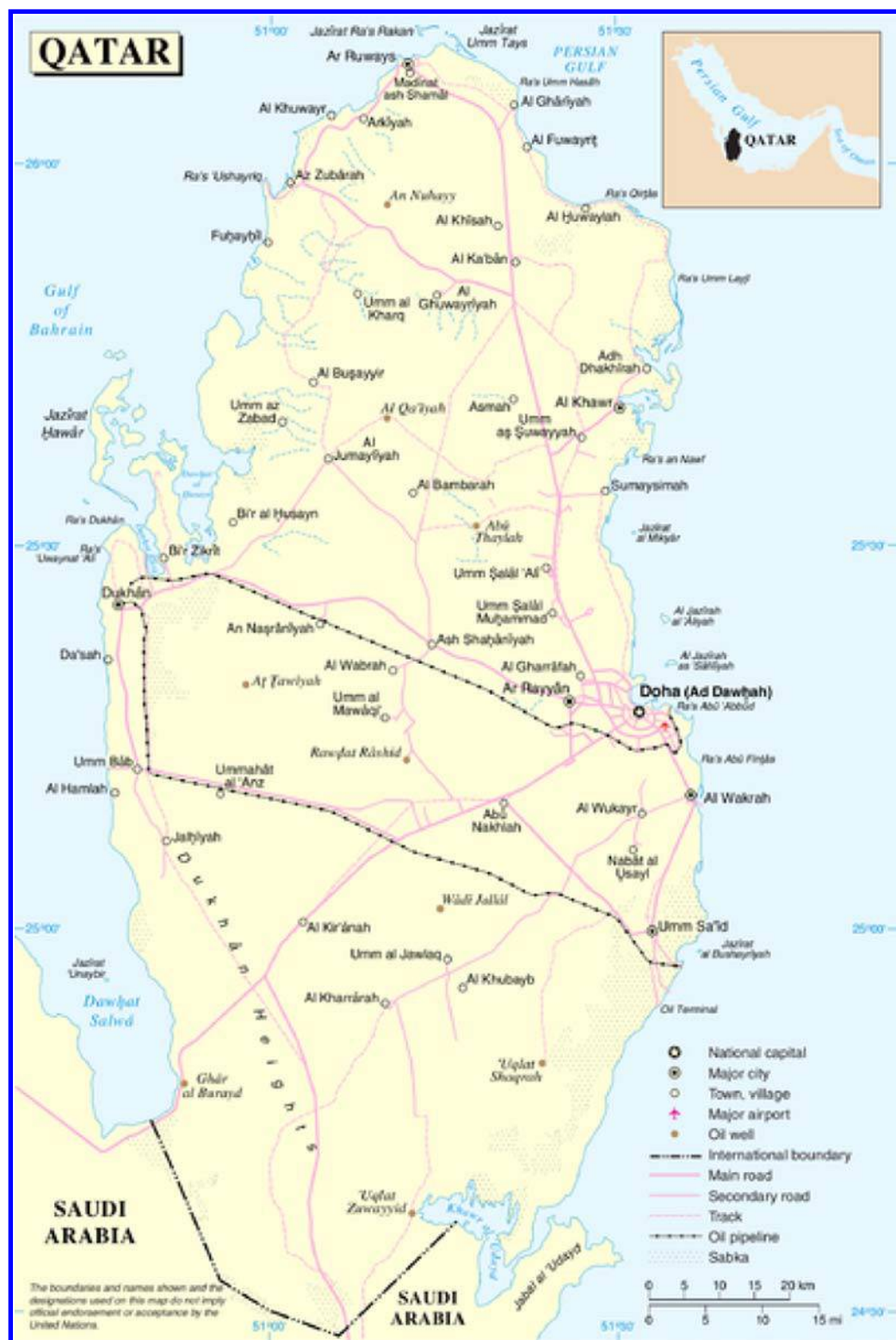
Figure 1. Map of Qatar.

Depressive symptoms have been shown to be strong independent predictors of mortality, worse health status, poorer compliance [39], recurrent cardiac events, and increased health care use [36]. A recent extensive review of the link between depression and cardiovascular disease by Nemeroff and Goldschmidt-Clermont (September 2012) revealed that depression is associated with increased risk of