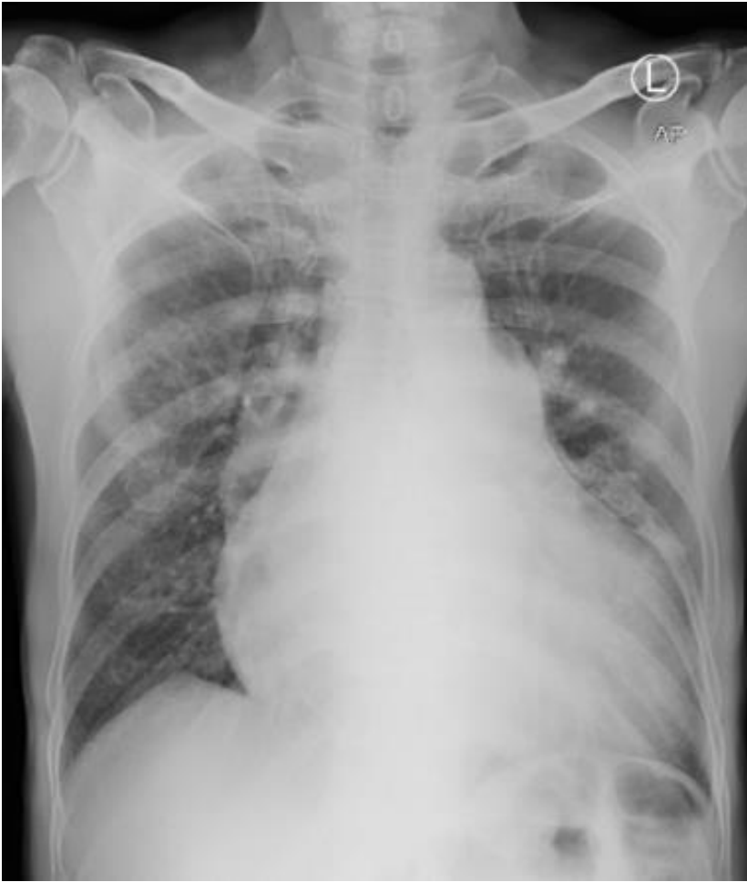
Figure 2. Postero-anterior chest x-ray

An electrocardiogram (ECG) examination showed atrial fibrillation with normal ventricular response (AF NVR) (Figure 1). Postero-anterior chest x-ray showed an enlarged heart to the left side with the apex embedded in the diaphragm and the waist of the heart protruding, as well as signs of cranialization in pulmo, which gave the impression of cardiomegaly with signs of pulmonary oedema (Figure 2).