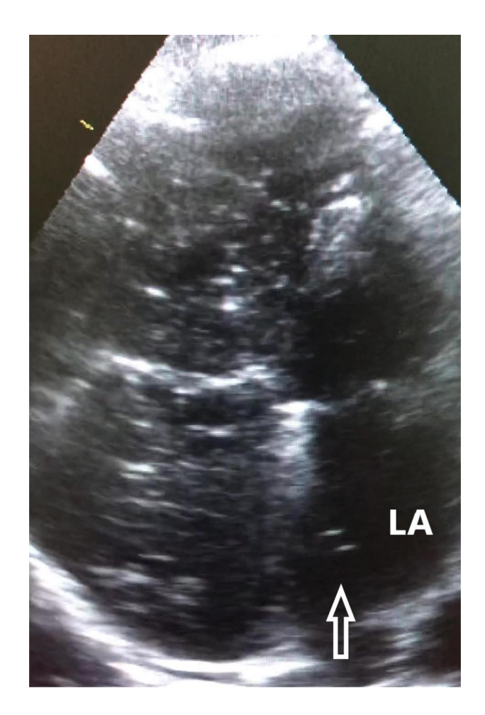
Figure 2. TTE using bubble contrast. Appearance of microbubbles (arrow) in left atrium (LA) in apical 4-chamber view on TTE is indicative of right to left atrial shunt.