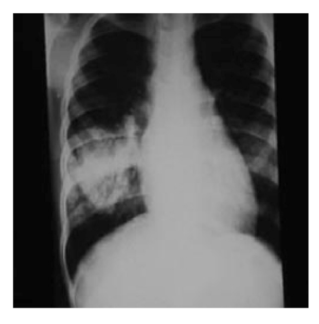
Figure 1. CXR shows a rounded, well-delineated shadow on the right lower lung zone.

Evaluation in our department revealed that she did have dyspnea, cyanosis, and clubbing. She had a flow murmur at the left sternal border compatible with an innocent murmur. Her chest x-ray showed a large density over the right lower lung field (Fig. 1).