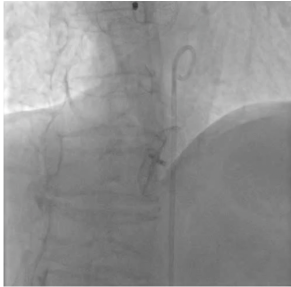
Video 1. On abdominal aortography, the new device on atrial septum and old-embolized device in the aortic wall, are easily seen. Video available on journal website.

The percutaneous closure of ASD is gaining in popularity. Complications are rare but may be important. Absence of residual shunts and late thromboembolic events may necessitate surgical closure of ASDs [7] . Embolised devices can be retracted percutaneously, especially when detected early. However, some embolisms which migrate to major vascular structures like our patient, need surgical procedures because of the risk of rupture of the aorta [8] . Alternatively, as in the case reported here, medical follow-up can be a solution instead of surgery.