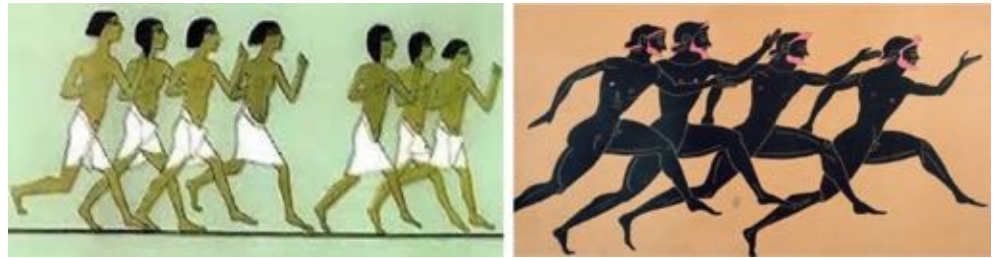
Figure 1. Ancient Egyptian and Greek runners.

Irisin binds to white adipose tissue (WAT) and upregulates the expression of peroxisome proliferator-activated receptor \alpha (PPAR- \alpha ) and mitochondrial brown fat uncoupling protein1 (UCP1), which subsequently induces brown adipose tissue (BAT) gene program to transform WAT cells to beige adipocytes – known as ‘browning’ of subcutaneous WAT (Figure 2). 9, 10 This causes a significant increase in total body energy expenditure and thermogenesis.