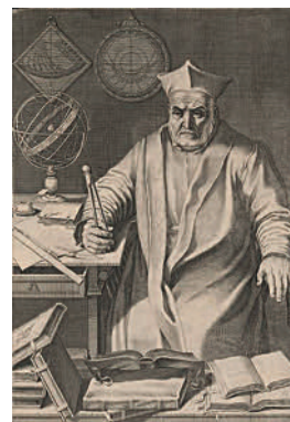
Figure 6. Christopher Clavius, Jesuit of the Roman College.

The Dominican friars (“Domini canes” = the dogs of God) started attacking Galileo, because of the ideas behind Copernican theory, in which the sun, not the earth, was at