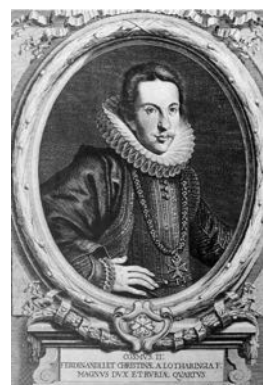
Figure 5. Cosimo II de’ Medici, Grand Duke of Tuscany.

On August 24, 1609, he had had the opportunity to present the telescope to the Doge Leonardo Donato and to the Council of Ten of the Serenissima Republic of Venice, watching at distance ships entering the Laguna from the top of the bell tower in St. Mark’s Square. They immediately realized the importance of the tool for military purposes and increased the salary of Galileo up to 1000 florins. Nevertheless, on June 10, 1610, he resigned from the chair in Padua, having accepted from Cosimo II de’ Medici the offer of a chair at the University of Pisa, free from teaching obligations and including Philosophy besides Maths.