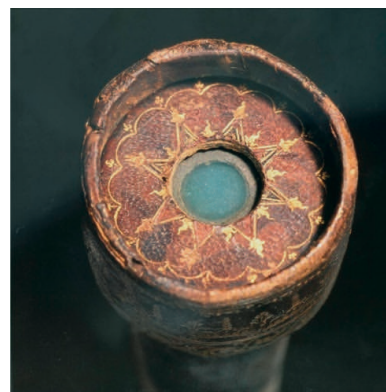
Figure 3. The “Eye” of Galileo’s telescope.