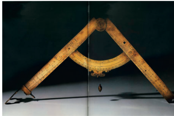
Figure 2. The geometric and military compass invented by Galileo.

He invented a telescope (Figure 3), with a 18–20 fold magnification, 6 which made it possible to establish that the Milky Way consisted of a multitude of stars; to see the inequalities of the surface of the moon (Figure 4), the “rings” of Saturn, sun spots,