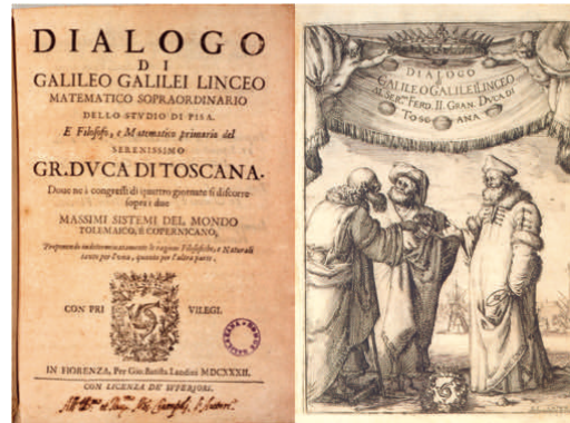
Figure 10. The “Dialogue concerning the Two Chief World System” published in 1632.