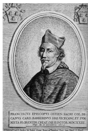
Figure 12. Cardinal Francesco Barberini.