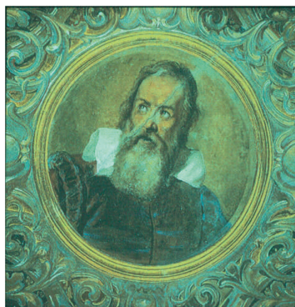
Figure 13. Galileo when he became blind bilaterally. (Painted in the ceiling of Aula Magna of the University of Padua, since 1992 named Galileo Galilei).

his views. On January 8, 1642, on the same day of his Jupiter observations by telescope, he died at Arcetri and was buried in a hidden Chapel of Santa Croce Church in Florence, without any official ceremony because he was still considered a heretic.