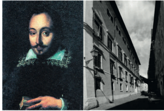
Figure 7. Federico Cesi, founder of the Lincei Academy in 1603.

the centre of the universe, thus contradicting the Bible. The Dominican friar Tommaso Caccini (1574–1648), on December 21, 1614, violently blamed Galileo from the pulpit of Santa Maria Novella in Florence, strongly defending the literal scriptures, and clearly accusing Galileo of heresy.