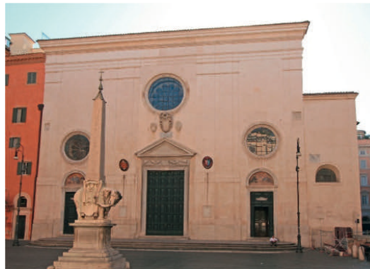
Figure 11. S. Maria Minerva church.

to Sacred and Divine Scriptures, namely that the sun and not the earth is the centre of the universe. He was condemned to deny, curse, and hate his mistakes (“abiura”). “With sincere feeling and faith I abjure, swear and abhor my mistakes and heresies contrary to Catholic and Apostolic Roman Church.” 17