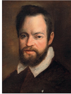
Figure 1. Portrait of a young Galileo by Domenico Cresti “Il Passignano”.

In Padua, he spent 18 years, “the best years of my life”. 4 He invented the compass (Figure 2), he wrote books on mechanics and cosmography for students. The teaching activity was hard, since the University council was very demanding. 5