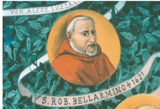
Figure 8. Cardinal Roberto Bellarmino graduated at the University of Padua.

On March 5, 1616, the book “De revolutionibus orbium coelestium” by Nicolaus Copernico was prohibited and heliocentric theory was refused, being considered opposite to the Scriptures. Unfortunately, Cardinal Bellarmino and Cosimo II died in 1621, and with them Galileo lost his supporters.