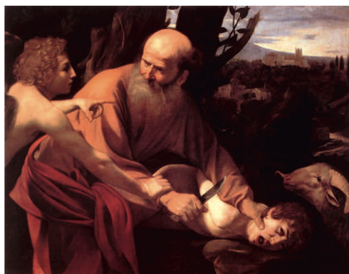
Figure 15. The sacrifice of Isaac. Caravaggio, 1603. Uffizi Gallery, Florence.

Could it be that God asked Galileo to leave aside the presumption of science, just as God asked Abraham to sacrifice his son Isaac to test his loyalty (Figure 15)?