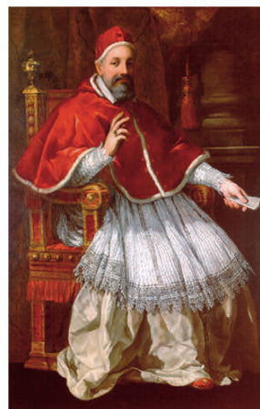
Figure 9. Maffeo Barberini, Pope Urban VIII.

He was put into jail and in June 1633, brought to trial in the Church of Santa Maria Minerva (Figure 11). 16 He was charged with heresy for believing false doctrines, contrary