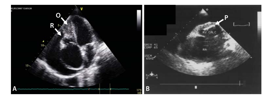
Figure 1. Endomyocardial fibrosis of the right ventricle. 1A: Echocardiogram in apical 4-chamber view with characteristic features of (O) obliteration and (R) retraction of the right ventricle with reduction of the right ventricular cavity size. Notice thickening of the tricuspid valve, dilatation of the right atrium and pericardial effusion 1B: Echocardiogram in paraternal short axis view shows a large fibrotic plaque with marked fibrosis and calcification. Again, noted are the enlarged right atrium and large pericardial effusion.

Ugandan Heart Institute and the cardiology ward at Mulago Hospital. Eight were found to have moderate disease and were excluded from this analysis. Fifty control subjects, matched for age and ethnic group, documented by echocardiogram to be EMF negative, were recruited from among the patients being evaluated at the Uganda Heart Institute.