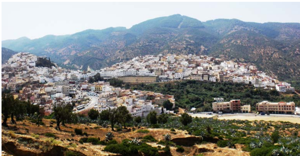
Figure 2. City of Fez, Morocco.