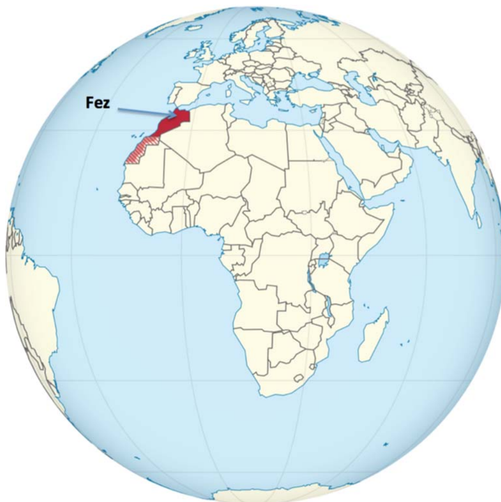
Figure 1. Map of Morocco, showing Fez and disputed Western Sahara region (original adapted from ‘TUBS’ http://commons.wikimedia.org/wiki/File:Morocco_on_the_globe_(claimed_%2B_de-facto_hatched)_(Africa_centered).svg ).